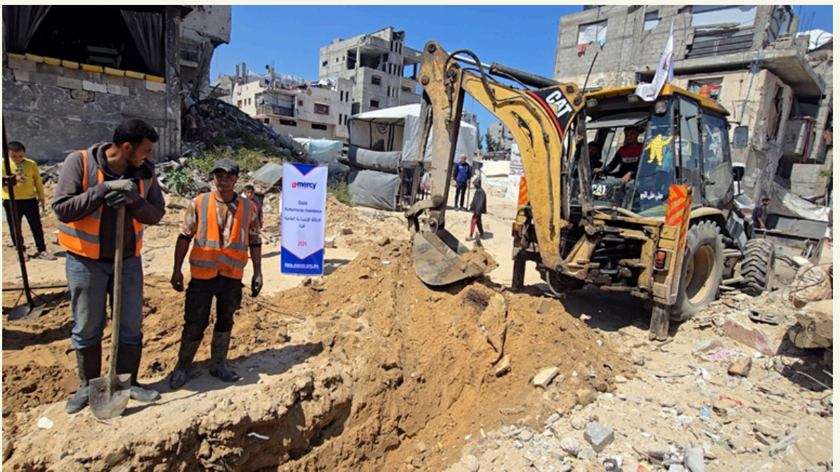
SEWAGE LINE MAINTENANCE