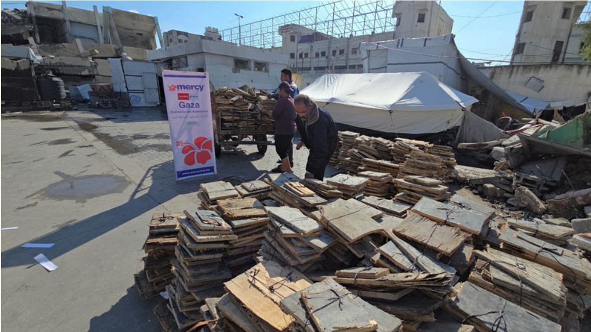
DISTRIBUTING WOOD FOR COOKING AND HEATING